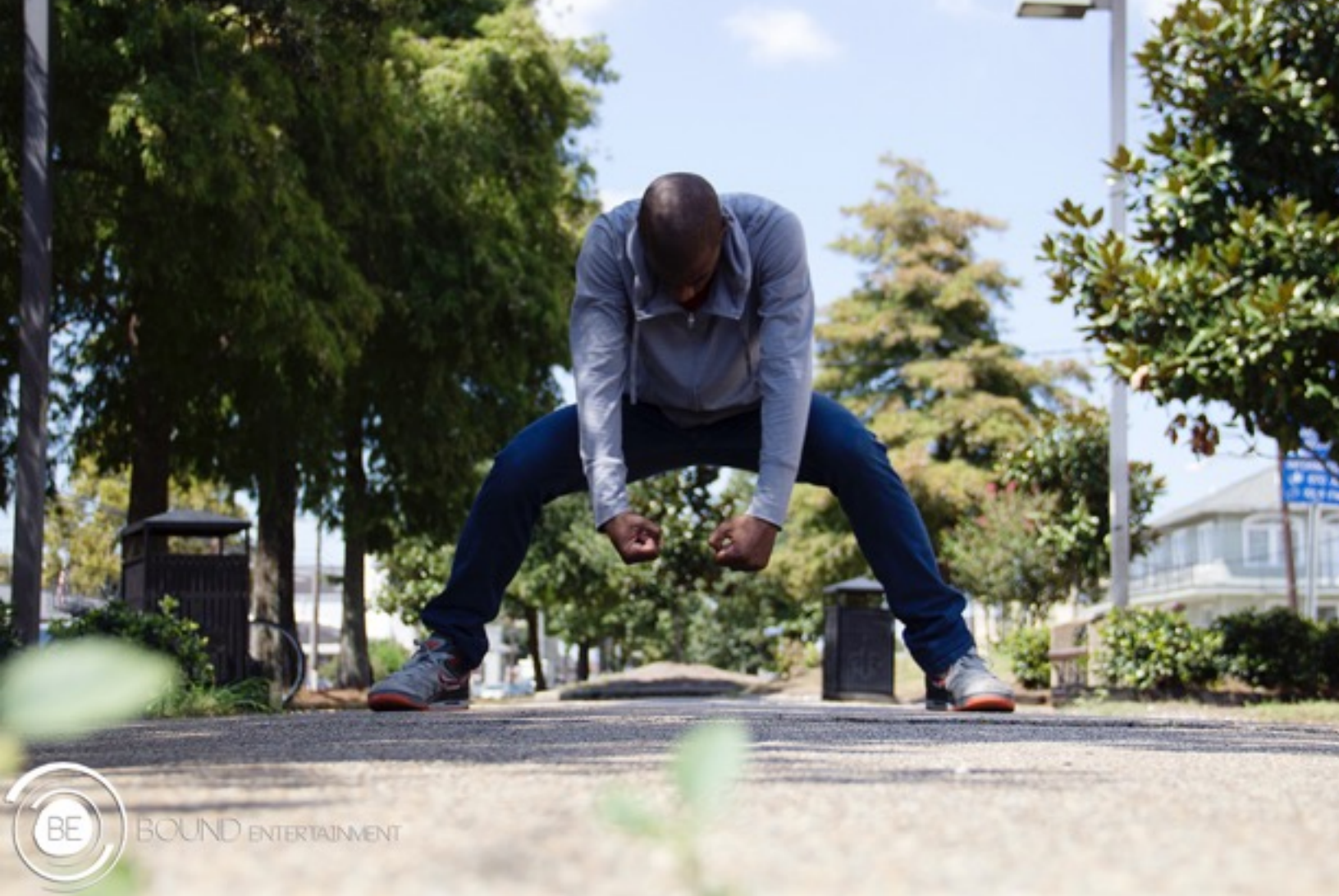
Taken - choreography by Kesha McKey

KMDP has been awarded Big Easy Classical Arts Award nominations as well as project assistance grants from The Arts Council New Orleans and Alternate Roots to present the choreographic works of emerging artists for "Vessels", a self produced concert at the Contemporary Arts Center N.O.