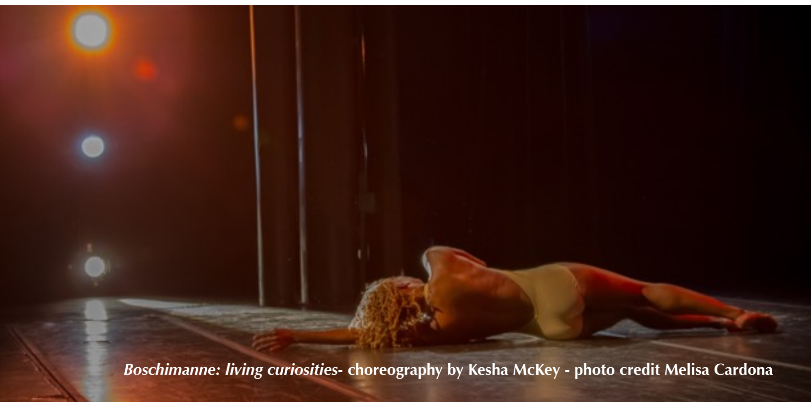
Boschimanne: living curiosities- choreography by Kesha McKey